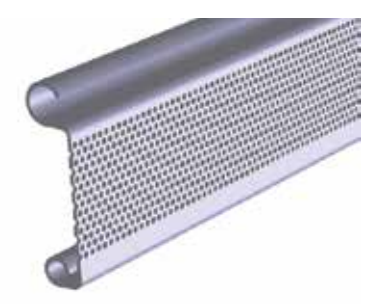
Secur-Vent® — Perforated slat provides optimal security and ventilation. Slat consists of 1/16" diameter holes offering 17% open area over length of each slat. Available in No. 14 flat slat up to 22' wide x 20' high (available in 20-gauge steel only).