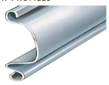
No. 4 — Curved-faced single crown slat available in up to 16-gauge steel, up to 18-gauge stainless steel, or up to 14-gauge B&S aluminum. Depth of crown: 7/8", 2-5/8" on centers.