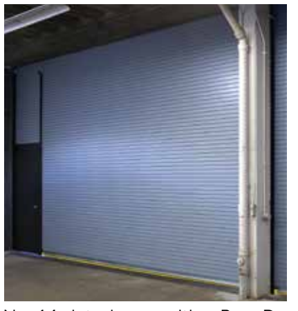
No. 14 slat, shown with a Pass Door