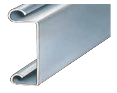
No. 14 — Flat-faced slat available in up to 16-gauge steel, up to 18-gauge stainless steel, or up to 14-gauge B&S aluminum. Depth of crown: 3/4", 2-7/16" on centers.