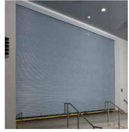
No. 4 slat