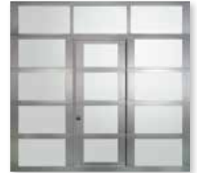
Pass Door Exterior View